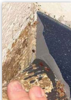
Inspect your new place for infestations before moving in.