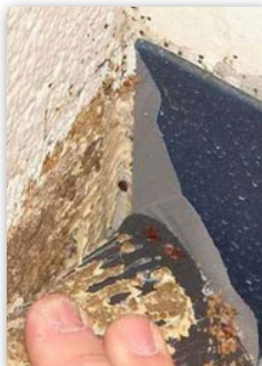
Inspect your new place for infestations before moving in.